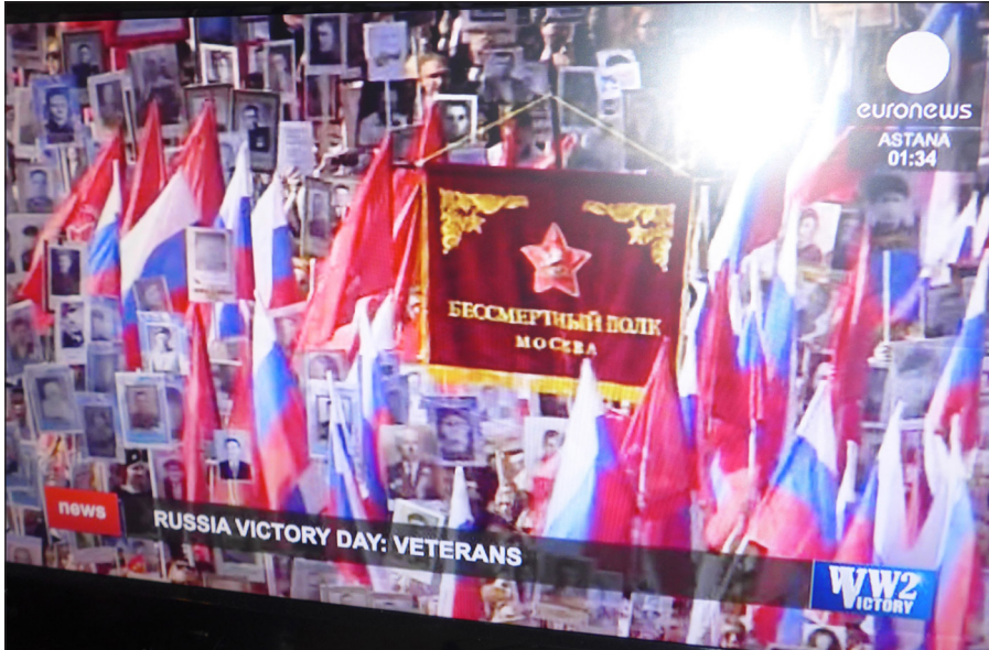
Figure 1. The bessmertnyi polk - Moscow, Red Square, May 9, 2015

Figure 1 illustrates a powerful recent political effort to mobilize the personal family ties into the service of expansion of patriotic unity feelings around the issue of celebrating 70 years from the end of World War 2 in Europe. The history of a war won (or lost) matters – and is made to work for – the future. New generations, carrying the photographs of their deceased relatives who were in the war, join the promotion of the new vigilance of defense of their country in the future. Adding the notion of eternity ( bessmertnyi , immortal) to the collective military unit ( polk , a battalion) carries the affective personal links with one’s relatives forward to future readiness to devote the lives of the young (and their children) to the future political needs of the “fatherland”. Patriotism is promoted in all societies (Carretero 2011) and its function is set up ahead of time when it is needed to achieve concrete political goals. The nature of wars may change in history (Beck 2005; Leach 2000) yet these remain – as von Clausewitz (1908/1832) pointed out in the nineteenth century – a continuation of politics through military means (Roxborough 1994). The wars fought in the courts of law in any country, or between them, are peacetime continuations of the military acts on real battlefields.